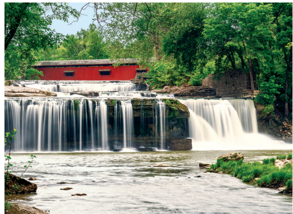
Cataract Falls Covered Bridge in Indiana.

The Conference's tourism partnership, Great Lakes USA, successfully showcased the region and its many attractions to a record number of international tourists. The partnership launched a marketing program in China, the world's fastest growing source of tourists, and continued successful programs in the United Kingdom/Ireland, and German-speaking countries. Great Lakes USA's "Preferred Partner" program continues to grow with new members joining the marketing consortium.