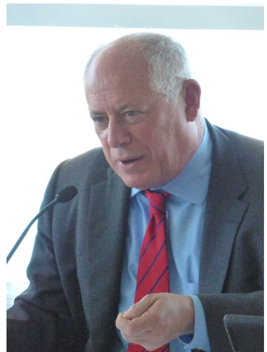
Illinois Governor Pat Quinn