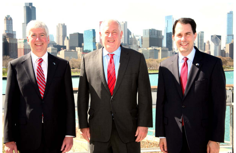
Michigan Governor Rick Snyder, Illinois Governor Pat Quinn, and Wisconsin Governor Scott Walker at the Council of Great Lakes Governors 2014 Executive Meeting.

On April 25-26, the Great Lakes Governors and the Premiers of Ontario and Québec gathered at Chicago's Shedd Aquarium for the Council of Great Lakes Governors 2014 Executive Meeting. The meeting's theme was "Accelerating Progress," following up on last year's breakthrough summit on Mackinac Island, Michigan. In Chicago, the Governors and Premiers announced a series of actions to further enhance our region's competitiveness and better protect our environment.