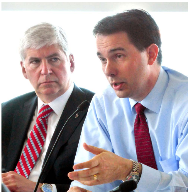
Michigan Governor Rick Snyder and Wisconsin Governor Scott Walker

Ontario Premier Kathleen Wynne; Pennsylvania Governor Tom Corbett; and, Québec Premier Philippe Couillard were also present and participated on their behalf during the meeting’s events.