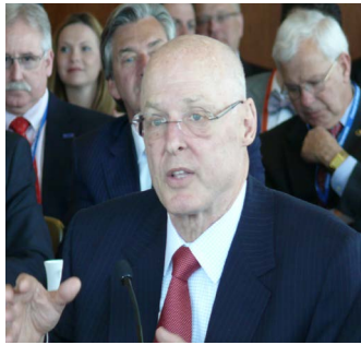
Secretary Henry Paulson speaks during the Council's Executive Meeting.

“Unlike bond holdings, which can be bought or sold through a quick paper transaction, direct investments involve people, plants and other assets. They are, in this sense, a vote of confidence in another country’s economic system,” said Henry M. Paulson, Jr., chairman of The Paulson Institute. “At a moment of considerable transition in the world economy, many emerging economies hold substantial foreign exchange reserves but are also beginning to seek productive direct