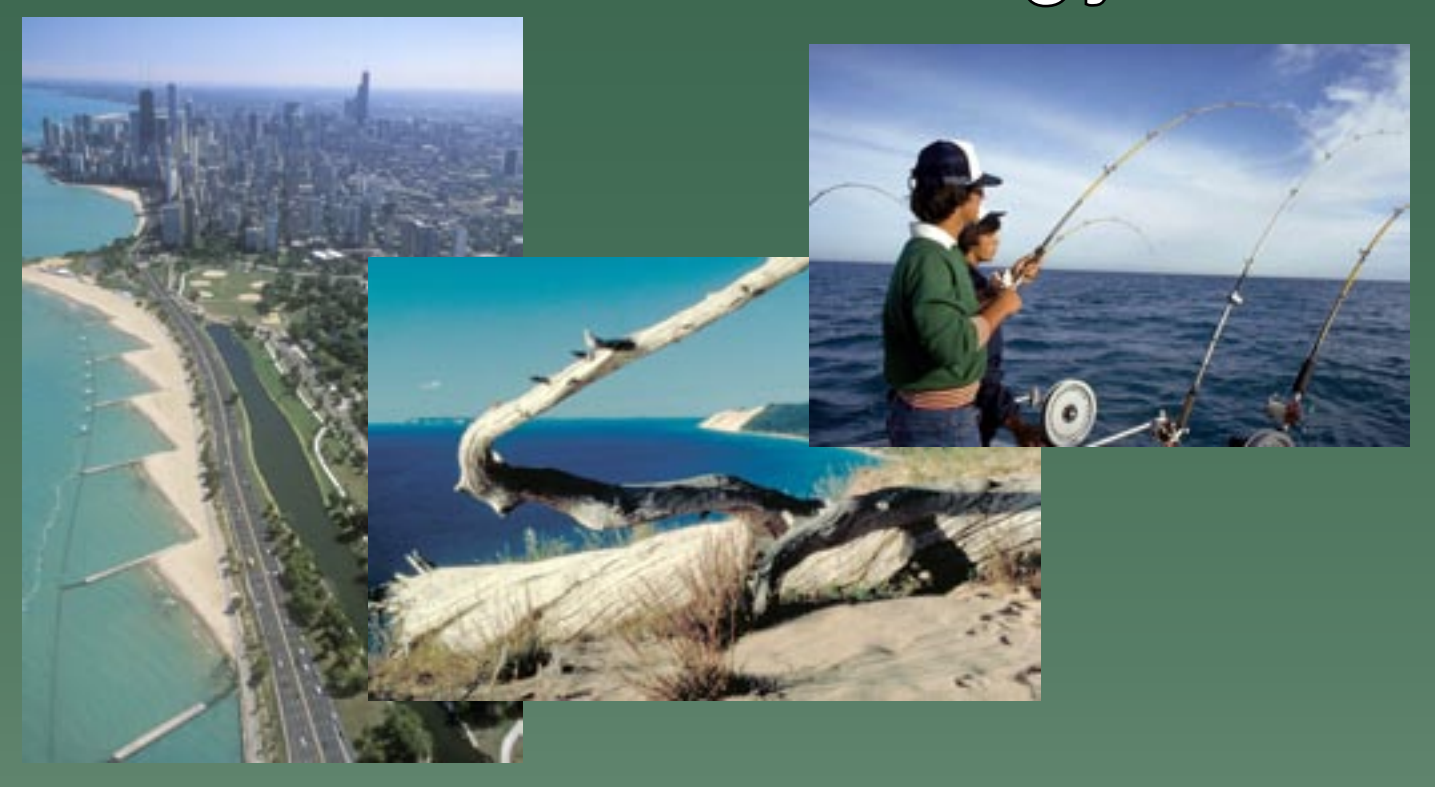
To Restore and Protect the Great Lakes